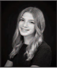
Mycajah Emery Ensemble