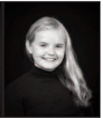
Clara Mintie Ensemble