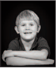
Sterling Brettingen Ensemble