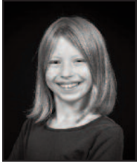
Isla Bolha Ensemble